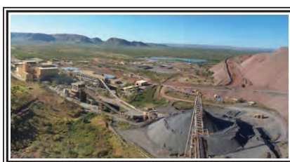
AUSTRALIAN ARGYLE DIAMOND MINE, WESTERN AUSTRALIA

Every Australian Chocolate Diamond by Eternity Diamonds is laser inscribed for added security protection. My Diamond Story certifies and reflects an accurate report verifying the diamonds journey from the mine to you. Characteristics of all Australian Chocolate Diamonds are graded against international standards of